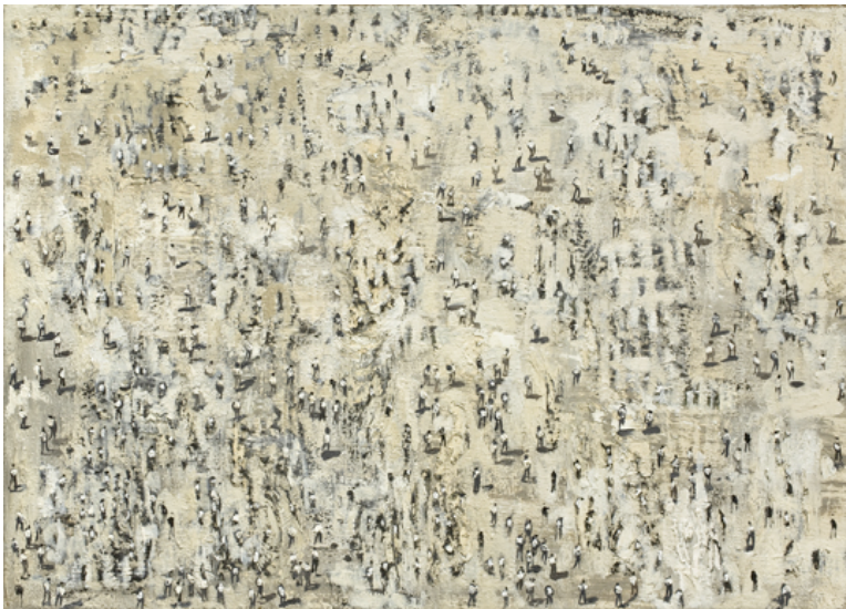
THOMAS HARTMANN , Land Und Leute (Land and People) , 2009, Oil on canvas, 28 x 40 inches