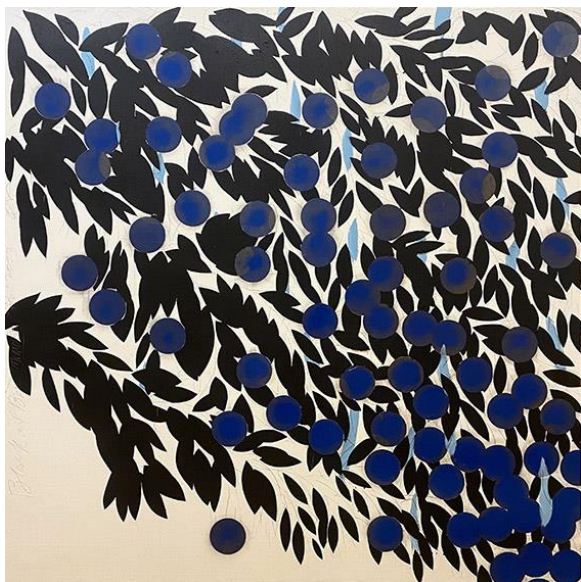
DONALD SULTAN; Black and Blue Mimosa ; 2023; Enamel, tar, graphite and vinyl on Masonite; 48 x 48 inches (121.9 x 121.9 cm)