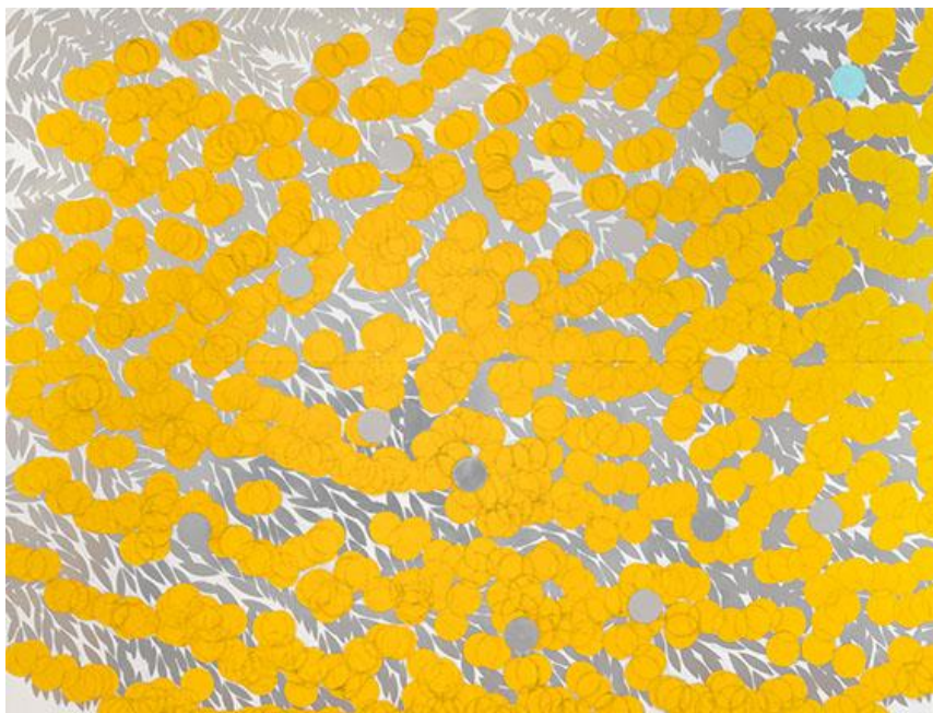
DONALD SULTAN; Mimosas With Silver Leaves and Two Anomalies ; 2022; Enamel, graphite, cement and silver spray paint on Masonite; 72 x 96 inches (182.9 x 243.8 cm)

juliek@rosenbaumcontemporary.com , 561-994-4422 x138.