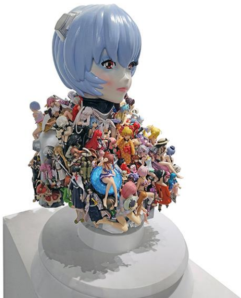
HERNANDO ALZATE ; Ayanami ; 2023; Plastic, epoxy resin and anime collectible figures; 36 x 18 x 18 inches (91.4 x 45.7 x 45.7 cm)

juliek@rosenbaumcontemporary.com , 561-994-4422 x138.