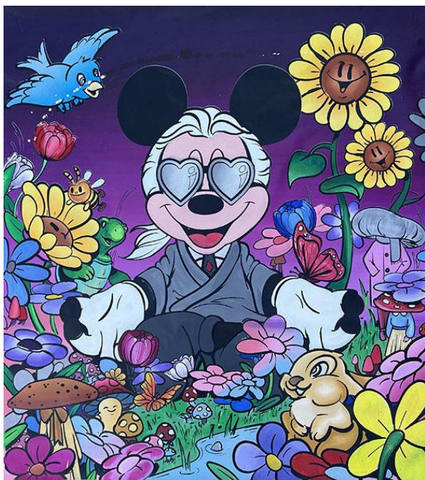
SKYLER GREY; Meditation of Victory ; 2022; Acrylic, spray paint and ink on canvas; 43 x 43 x 2 inches (109.2 x 109.2 x 5.1 cm)