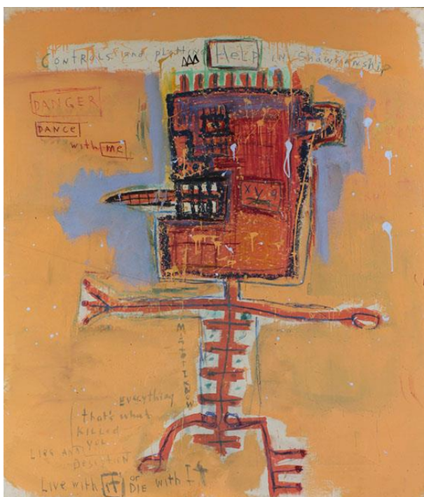
JIM STELLA; Untitled ; 2019; Mixed media including graphite, oil stick, acrylic paint, oil paint and oil pastels; 63 1/2 x 74 inches (161.3 x 188 cm)