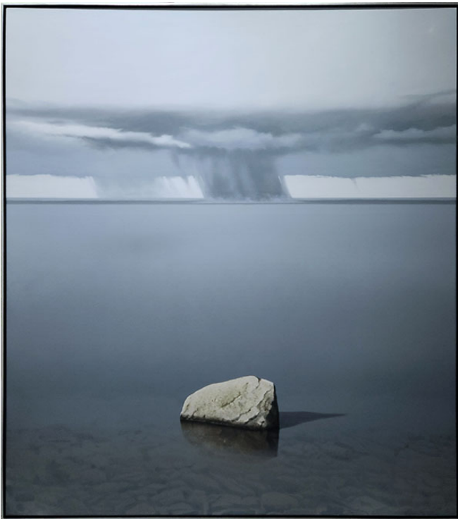
The Lost Landscapes III , 2023, Oil on canvas, 77 x 66 inches (195.6 x 167.6 cm)