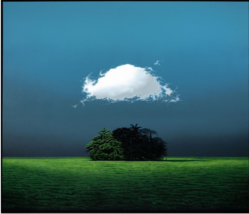
Ritos y Silencios , 2023, Oil on canvas, 66 x 77 inches (167.6 x 195.6 cm)