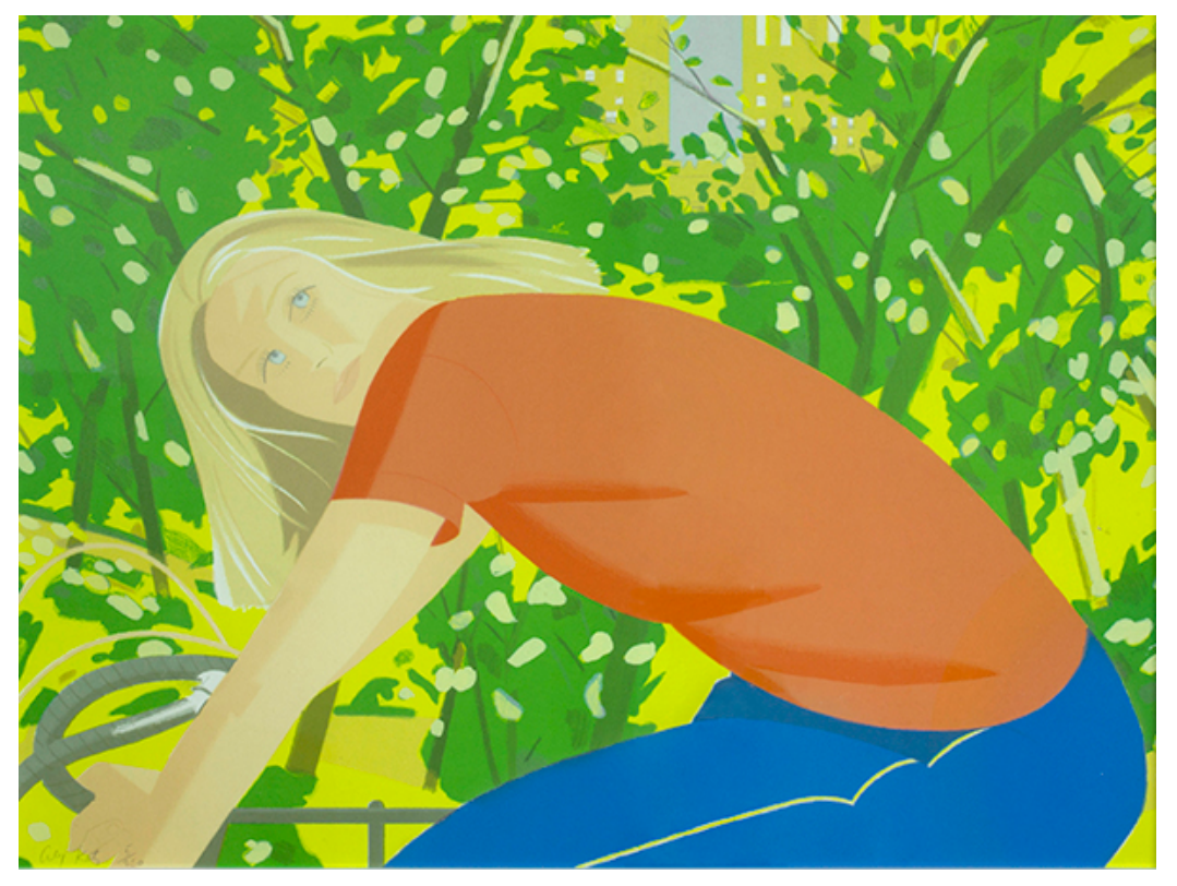
ALEX KATZ ; Bicycle Rider ; 1983; Lithograph from the New York , New York portfolio; 22 \times 30 inches ( 55.9 \times 76.2 cm); Edition of 250.