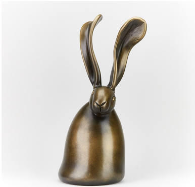
Bronze Age , 2021, Bronze, 13 1/2 x 7 x 9 1/2 inches (34.3 x 17.8 x 24.1 cm), Edition of 9