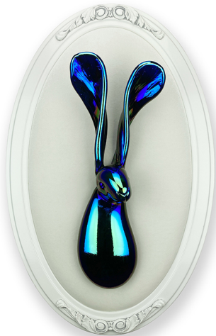
Antem , 2021, Blown glass bust, 27 x 17 x 9 inches (68.6 x 43.2 x 22.9 cm)