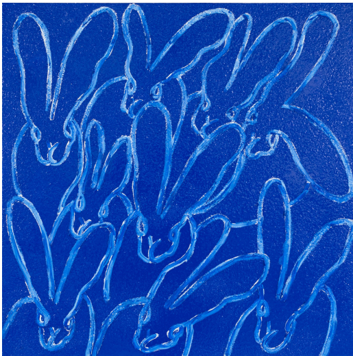
Cobalt Diamond , 2021, Oil and acrylic, 30 x 30 inches (76.2 x 76.2 cm)