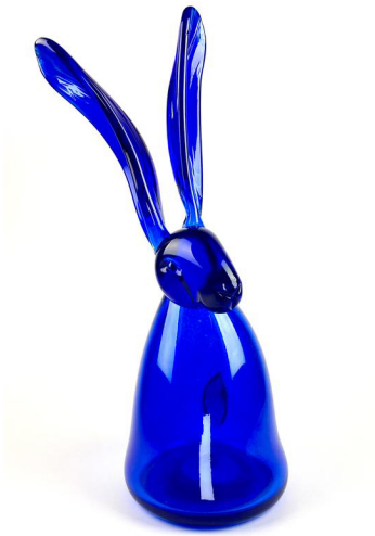
Cobalt Bunny , 2020, Blown glass, 19 x 9 x 9 inches (48.3 x 22.9 x 22.9 cm)

High-res. photos available upon request from Julie Kolka, Web/Marketing Manager, juliek@rosenbaumcontemporary.com , 561-994-4422 x136