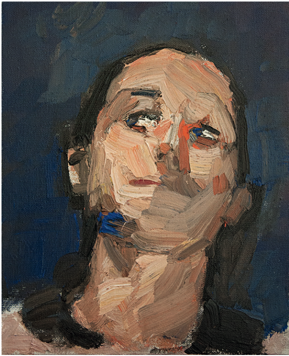
JURAJ KOLLÁR , Thoughtful 3 , 2014, Oil on canvas, 13 x 10 5/8 inches (33 x 27 cm)