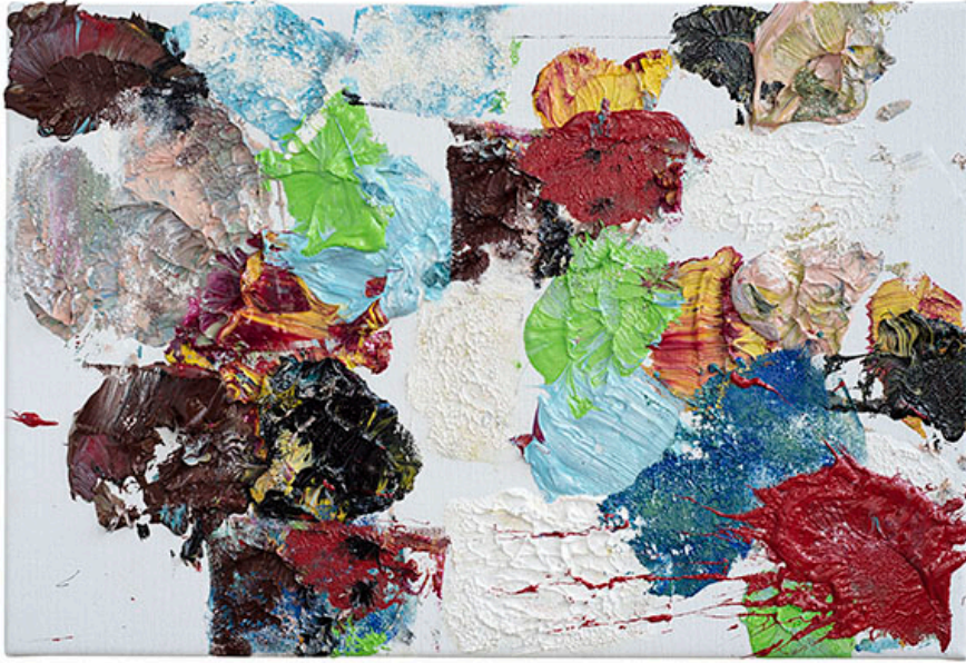
JURAJ KOLLÁR , 020819 , 2019, Oil on canvas, 16 1/8 x 24 1/8 inches (41 x 61 cm)