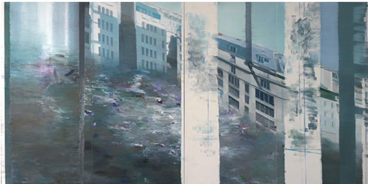
JURAJ KOLLÁR , View from Bobur , 2009, Oil on canvas, 76 ¾ x 152 ¾ inches (195 x 388 cm)