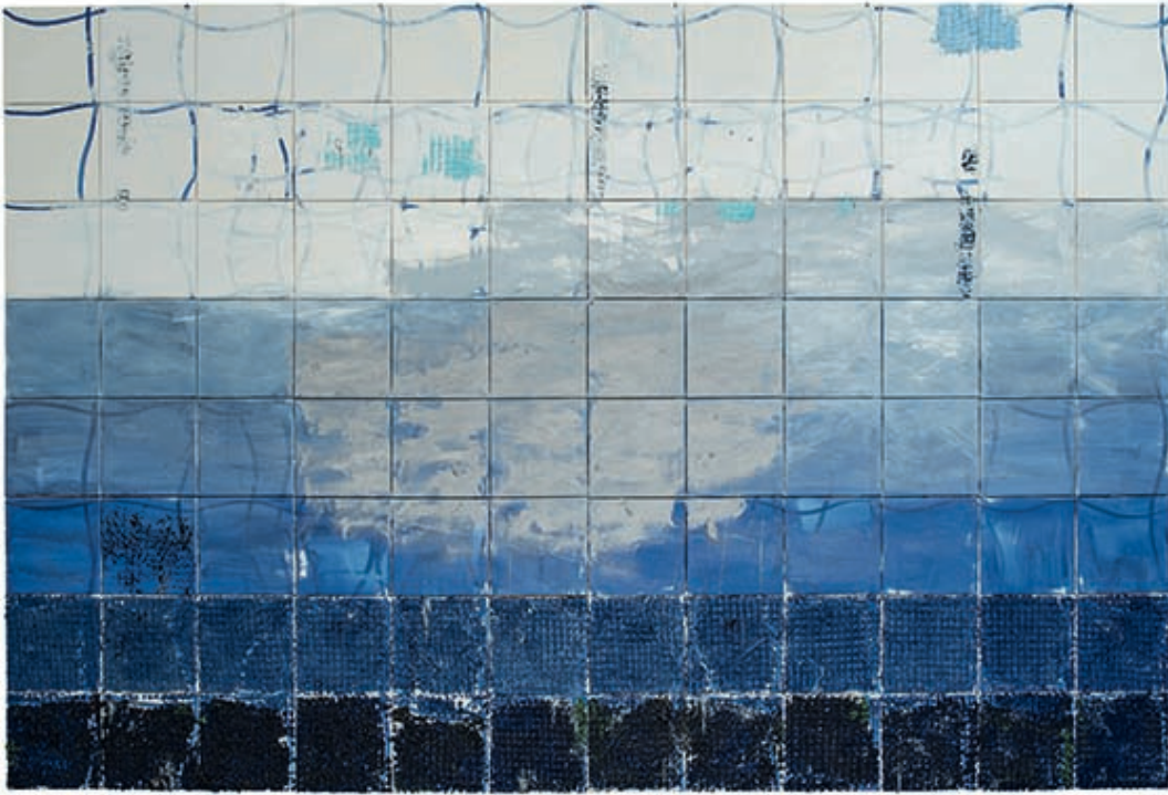
JURAJ KOLLÁR , Surface , 2018, Oil on canvas, 94 ½ x 141 ¾ inches (240 x 360 cm)