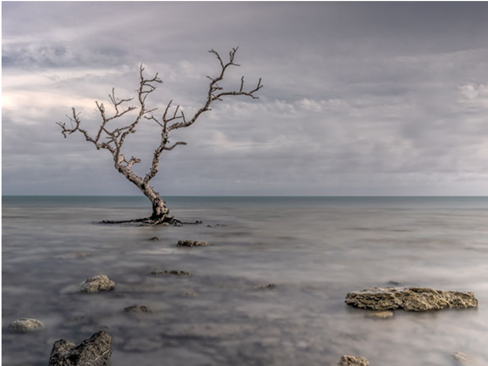
DONALD R. HARIVEL , Solo Survivor—Bahia Honda Key, FL ; 2020, FujiFlex Crystal Archive paper, 30 x 40 inches (76.2 x 101.6 cm), Edition of 100