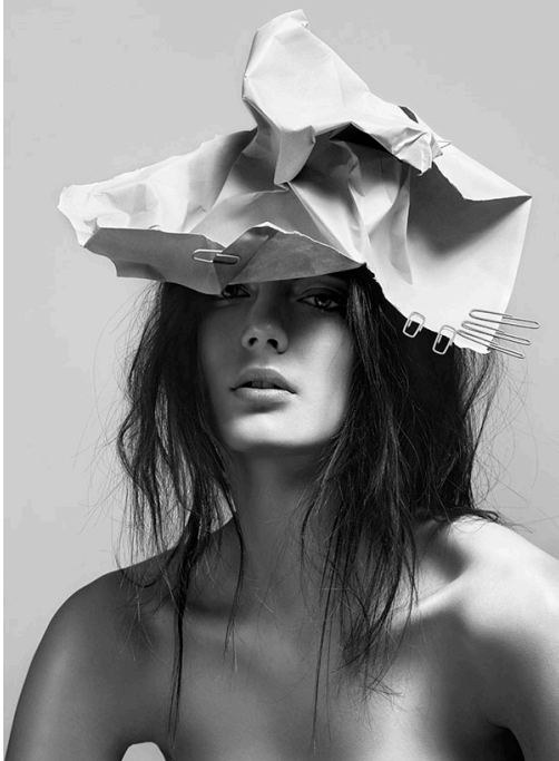
ULRICH KNOBLAUCH , Paper Hat , 2014, C-print, 50 x 36 inches (127 x 91.4 cm), Edition of 20