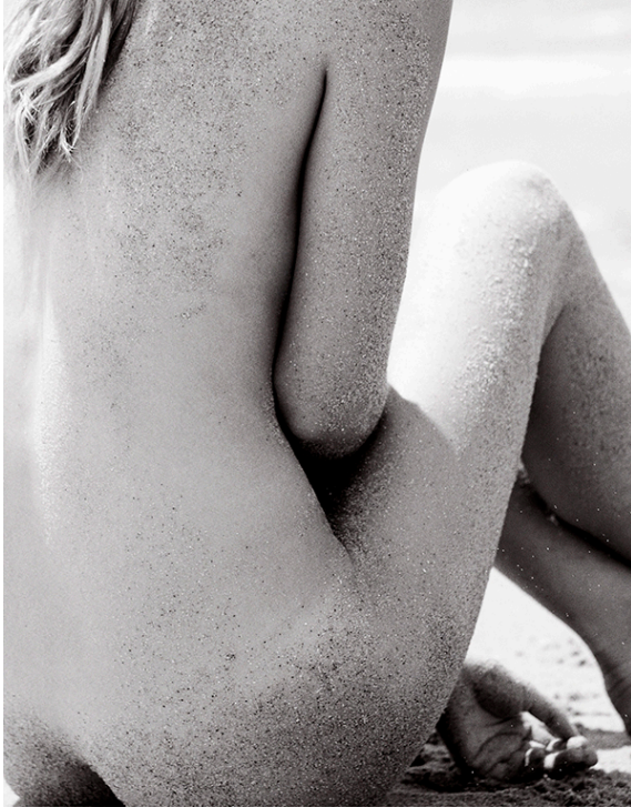
BEN FINK SHAPIRO , Body In Sand , 2011, Archival pigment print, 42 x 33 \frac{3}{4} inches (106.7 x 85.7 cm), Edition of 8